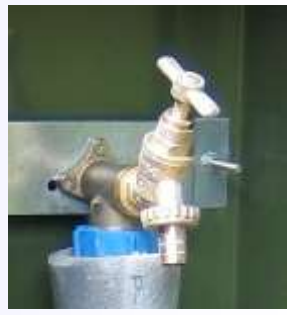
Hose Union Bib-tap 1/2" or 3/4" BS1010 DZR tap fitted Insulated MDPE pipework pre-installed