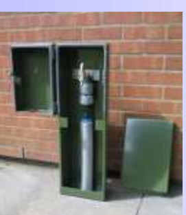
Lower Access Panel Can be removed for installation & service access