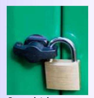
Secure latch will accept standard padlock