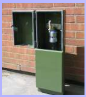
Hinged Tap Cover Good access to tap Can be closed with hose fitted